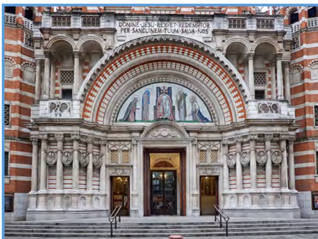
Westminister Cathedral entrance, London

A few baptism registers exist from the mid-1700s but numbers grew substantially after 1778. All Catholic registers (mostly of baptism, confirmation and marriage and including Scotland) are listed in Catholic Missions and Registers 1700-1880 (M.Gandy, 6 volumes, 1993). They are all in Latin.