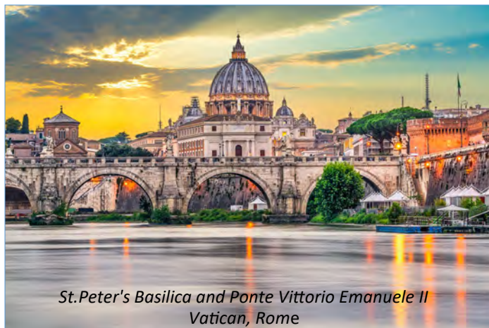
St. Peter's Basilica and Ponte Vittorio Emanuele II Vatican, Rome

Throughout the 1600s and early 1700s Catholics tended